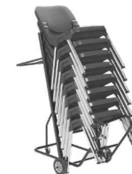
Progress Chair Trolley