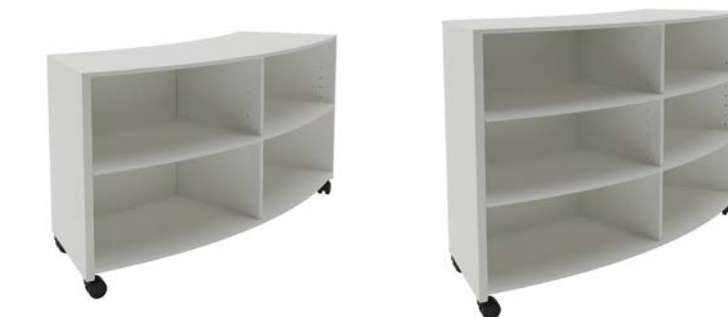
Smart Curved Smart Bookcase 720mm